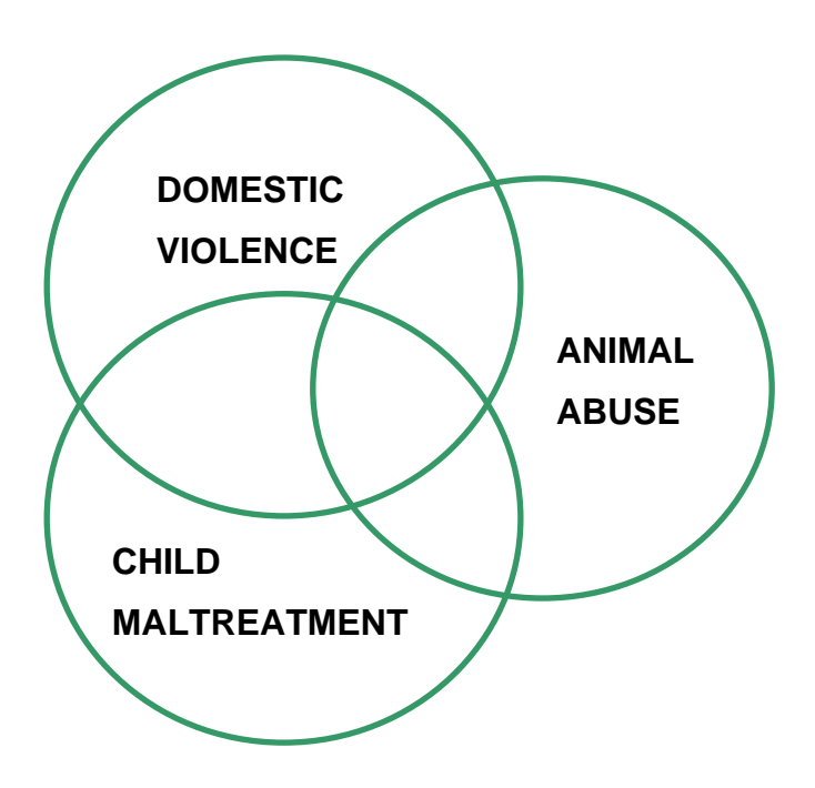
Figure 1.1 The interlocking circles of domestic violence, animal abuse and child maltreatment (Ascione and Arkow, 1999, p. xvi)

They suggest that this diagram helpfully assists our understanding of how each of these three distinct phenomena can occur independently and in conjunction with each other. Within these areas of interest, three major hypotheses appear to emerge from the existing research: