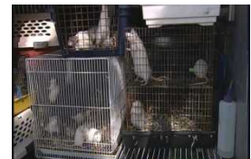
SPCA officials are caring for the seized animals