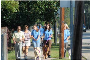
First Families of Whiteville, N. C., held a dog walk and blessing of the animals. The organization has participated in all three years.