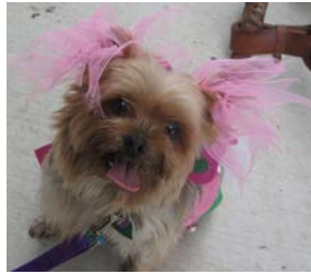
The Little Grass Ranch of Comfort, Texas held a dog fashion show and raised enough money to feed three horses for a month.