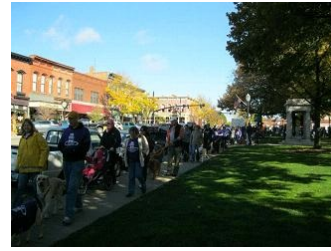
A large turnout paraded their pets to benefit the Domestic and Sexual Abuse Coalition of Medina, Ohio.