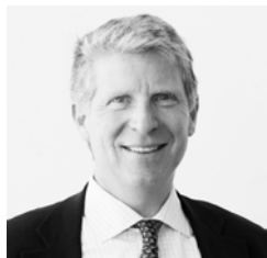
Cyrus R. Vance, Jr.

Citing Link research, Manhattan District Attorney Cyrus R. Vance, Jr., has announced the formation of the Big Apple’s latest animal cruelty investigation and prosecution unit. The unit streamlines procedures that have been in place for years and ensures that each case will be overseen by an expert in the field.