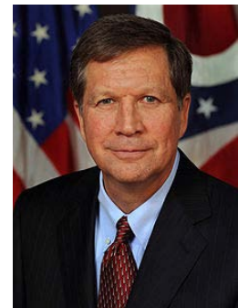
Gov. John Kasich

After protracted debate and delays, the Ohio General Assembly in December finally made Ohio the 42 nd state to prohibit people from engaging in sexual relations with animals or providing animals for others' sexual conduct. On Dec. 19, Gov. John Kasich signed into law 17 measures, including SB 331 , an omnibus measure that included the original SB 195 . Its provisions take effect 90 days after the signing.