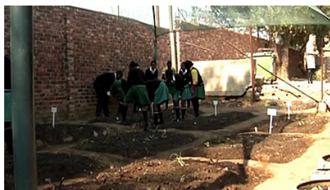
South African teens tend a food garden in a Link-based empathy curriculum.

A sprawling township mired in poverty and gender violence north of Johannesburg is the venue for an environmental awareness program that uses The Link to teach children to care. The two-hours-a-week program teaches tolerance and respect and molds youngsters into ambassadors who can identify and fight abuse.