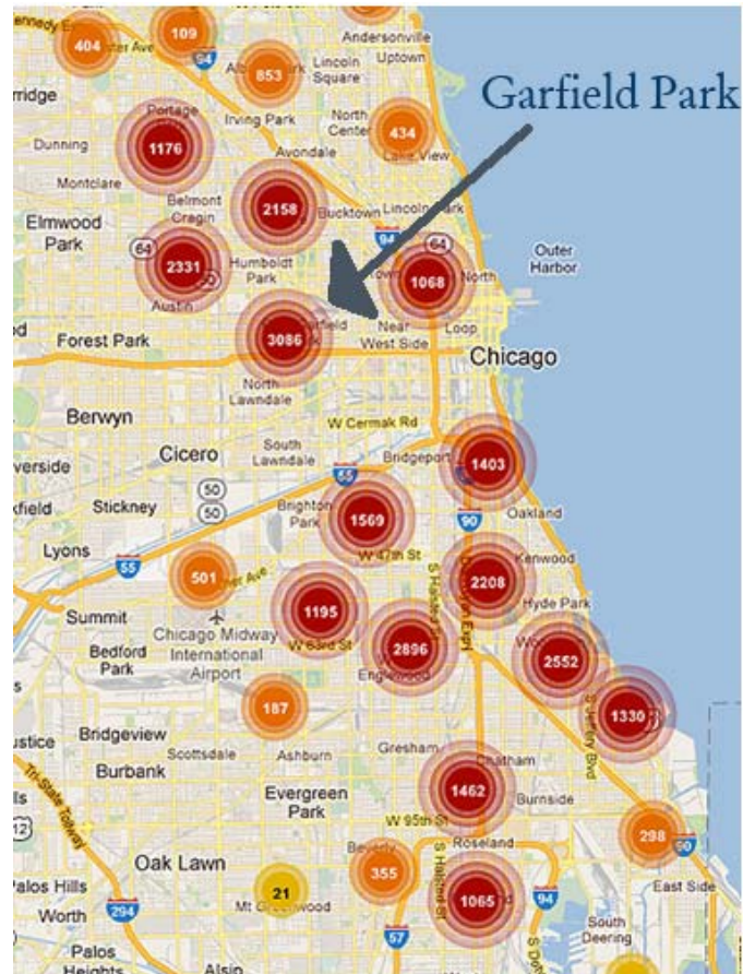
Map of the Garfield Park neighborhood. Circles depict number of domestic violence incidents in 2011.

Moser took this incident one step further and correlated the cruelty case with domestic violence in Chicago. He wrote that it shouldn’t be surprising that the levels of domestic battery in East Garfield Park, where the dog was found, are the highest in the city. The map (above) depicts all 2011 domestic-battery incidents (simple and aggravated). Over 3,000 incidents were recorded in the Garfield Park section.