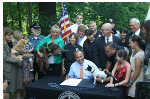
Gov. Deval Patrick is all smiles as he signs the historic bill, with enthusiastic officials and a few furry friends.

The Commonwealth of Massachusetts became the 23 rd state since 2006 to enact legislation allowing courts to include pets in protection-from-abuse orders in domestic violence cases when Gov. Deval Patrick signed S. 2192 on August 2. The new law allows courts to order defendants to refrain from abusing, threatening, taking, interfering with, transferring, encumbering, concealing, harming or otherwise disposing of any “domesticated animals” in the household. The procedure can apply in any temporary or permanent vacate, stay-away, restraining or no-contact order in any domestic relations, child custody, domestic abuse or abuse-prevention proceeding.